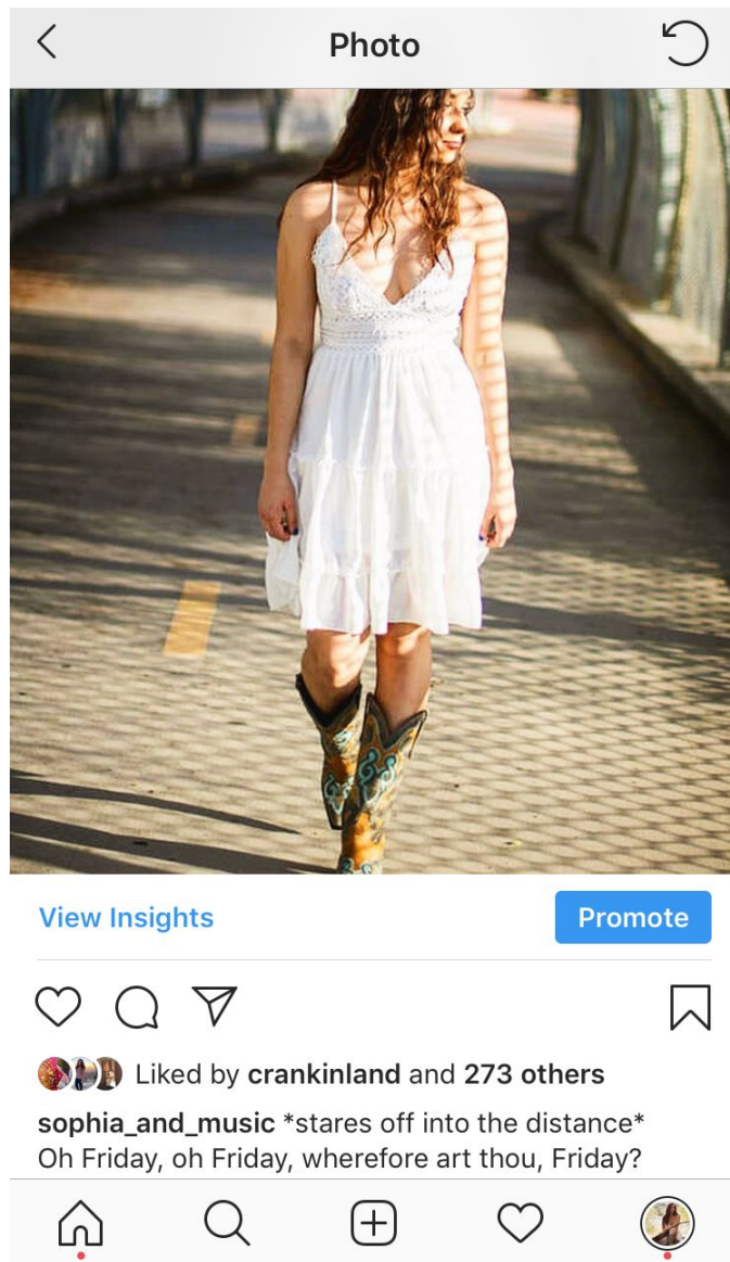
My first clue as to something big happening on Friday...:)

This week was all about the game plan for promoting the video. It is dropping in just a few days, so we need to make sure we give this all the attention it deserves. I am planning to do a paid promotion for the video through Instagram and Facebook and hopefully that will generate attention for it. I will also try to get as many of the models to talk about it as possible. Next I am going to reach out to as many people as I can and tell them in person and via social media that it is released so they have first-hand news that it is out. I am going to be annoying and only talk about this for a while, so I am putting the pedal to the metal and working my butt off to make sure everything goes as planned.