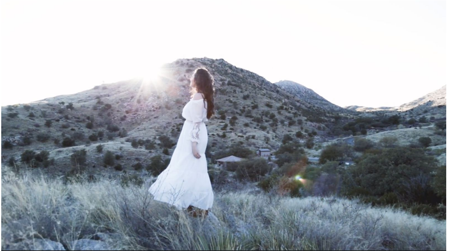
Me on the lookout for the drop of this cool music video!

This is finally happening, folks -- the music video release is underway. Sit back, relax, and get ready for the highlight of your week (I hope, I really hope you guys like it!). So much has gone into this video and I am so incredibly excited to show it off!